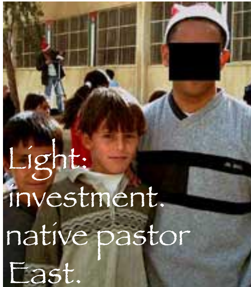
This pastor ministers to children in Jordan.

People of the Light: Make a shrewd investment. Partner with a native pastor in the Middle East.