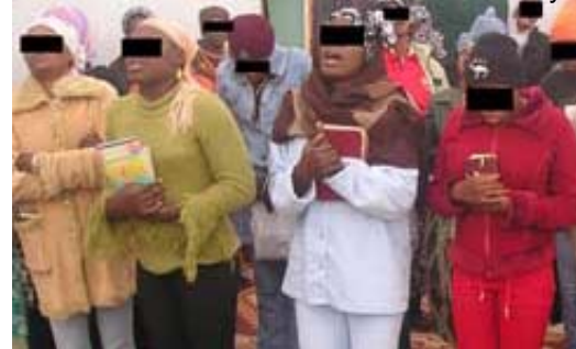
Pastors minister to these Christians in Libya.

Just fill out the pledge form on the back page of this brochure and mail it to us with your first month's pledge. Or, if you prefer, you may sign up for our pastor support email list by visiting our website . You'll find the sign up form at www.thelastharvest.com/newsletter/pastorsupport.html . (You must sign up for our enews to use this option.) You'll receive an introductory email with a pastor sponsor pledge form. Just click a link right in the email to pay using our secure PayPal account. You can also use credit cards on our PayPay account. You can sponsor as many pastors as you wish. We have over 250 native pastors working in these countries. We prayerfully ask sponsors to commit to support a pastor for one year.