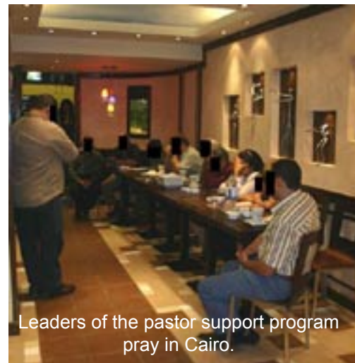
Leaders of the pastor support program pray in Cairo.

You will be encouraged to commit to faithful prayer for your native pastor, when you receive our photo of your pastor, so that you have his face before you when you pray. We ask that you do not duplicate this photo or post it anywhere in order to protect the pastor's safety. Although the pastor will know you